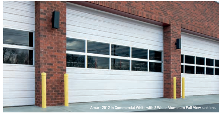
Amarr 2512 in Commercial White with 2 White Aluminum Full View sections

These open-back commercial steel doors are available in a variety of steel gauges and feature tongue and groove construction with a bottom weather seal to guard against the elements. These doors can be factory- or field-modified with CFC-free polystyrene insulation to fit the needed application.